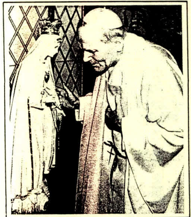
Pope John Paul in the hospital recovering from several serious gunshot wounds thanks Our Lady of Fatima for saving his life. He recognized in this assassination attempt on his life, and Our Lady's miraculous intervention and appeal from Her to listen to Her Fatima Message.