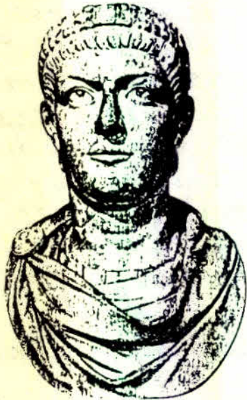
Constantine the Great, marble bust (restored), 4th century AD. In the Uffizi, Florence.

Constantine I, the first Roman emperor to profess Christianity, initiated not only the evolution of the empire into a Christian state but also provided the impulse for a distinctively Christian culture that prepared the way for the growth of Byzantine and Western medieval culture.