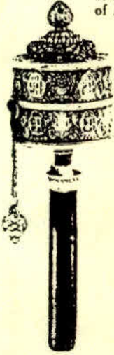
Tibetan prayer wheel, gilt silver, 18th-19th century; in the Seattle (Washington) Art Museum

After you know how to use the Rosary beads you can use the mysteries of the Rosary. During the recitation of the Rosary you meditate on the events (mysteries) in the life of Jesus and Mary.